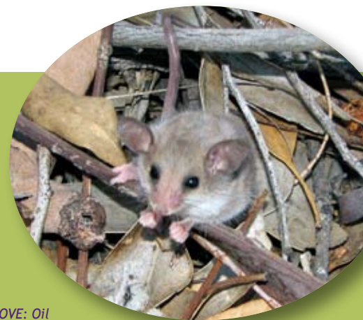
ABOVE: Oil mallees provide a rich source of feed for Western pygmy possums.

Marie discovered that the pygmy possums were able to travel over several hundred metres to exploit other habitats and believes the most beneficial oil mallee plantings will be those located near remnant vegetation that can provide additional food sources and nesting sites.